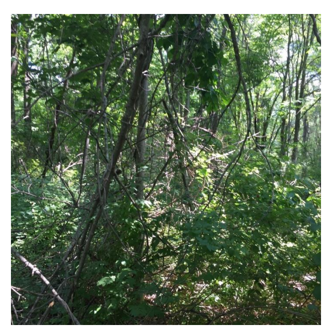
Tangled vines and shrubs characterize heavily invaded forest in the Sawyer Conservation Area's northeast.

Invasive plants (non-native species which compete with native vegetation) dominate the property's eastern and western ends. In the remainder of the property, conditions range from intermixed