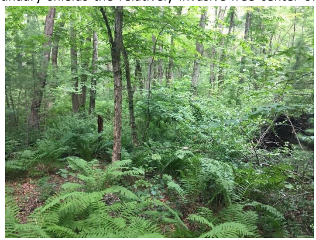
A milder invasive presence is found at the "leading edge" between the Transition and Scattered/Incipient zones.

Sawyer Conservation Area from the wider invasion. This transitional area generally contains less than 1,000 non-native stems per acre, with substantial native vegetation intermixed, though a density gradient exists where invasive concentrations are higher near heavily invaded becomes lighter areas and near scattered/incipient zone. A mixed treatment approach in this zone is likely needed, with handpulling, herbicide treatment, and light-mechanical removal used in combination. Any treatment scheme should begin at the boundary with the scattered/incipient zone and proceed outward toward the residential boundary or heavily invaded areas.