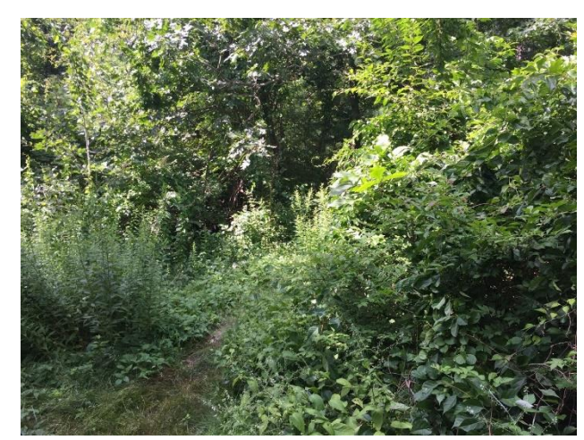
Removing the invasive thicket along the main access trail from Sawyer Avenue is recommended as a first phase activity.