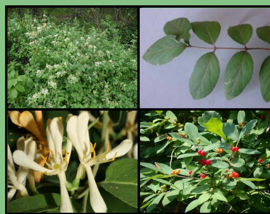
Morrow's honeysuckle ( Lonicera morrowii )