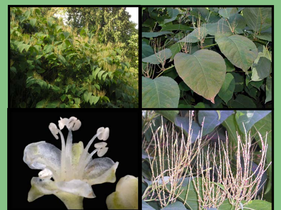
Bohemian knotweed ( Polygonum x bohemica )