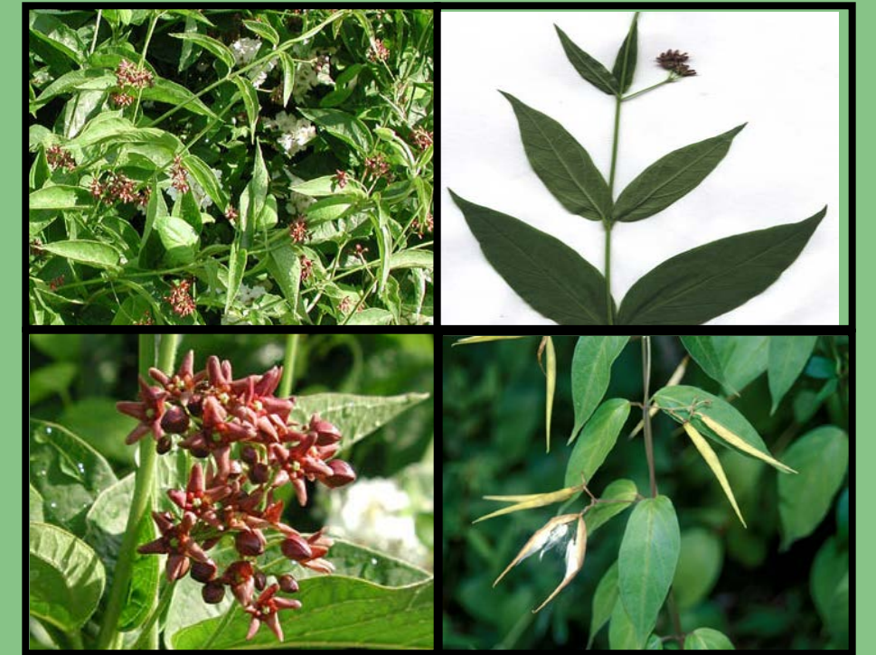
Pale swallow-wort ( Cynanchum rossicum )