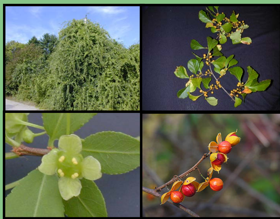
Oriental bittersweet ( Celastrus orbiculatus )