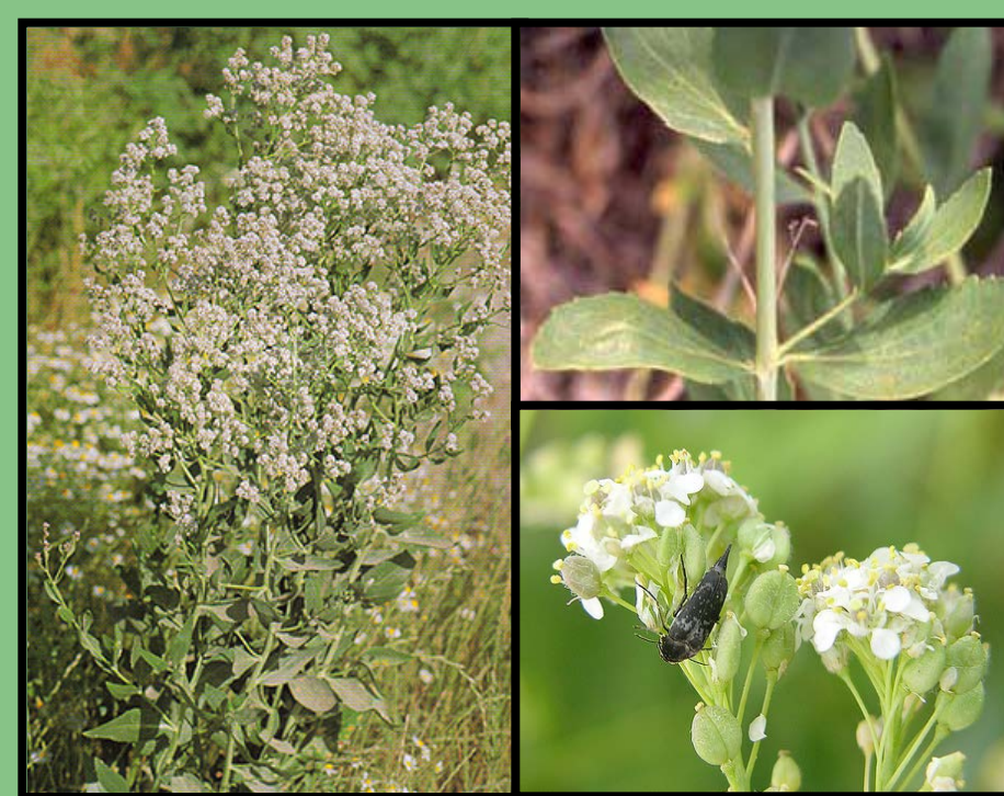
Perennial pepperweed ( Lepidium latifolium )