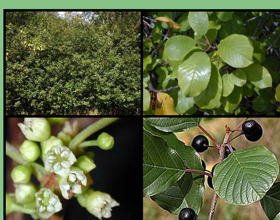
Glossy buckthorn ( Frangula alnus )