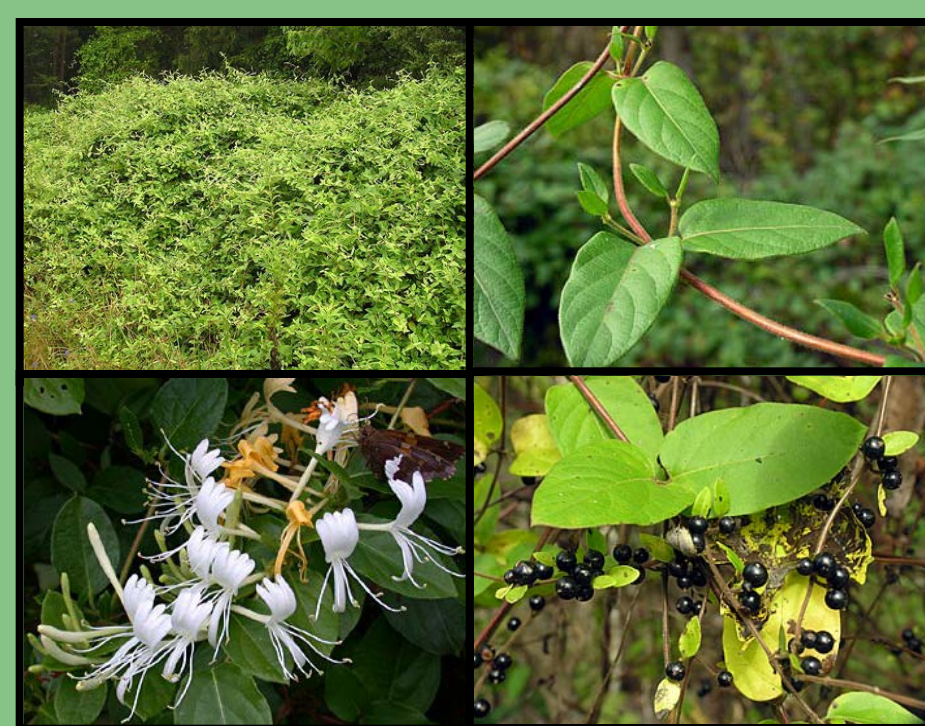
Japanese honeysuckle ( Lonicera japonica )