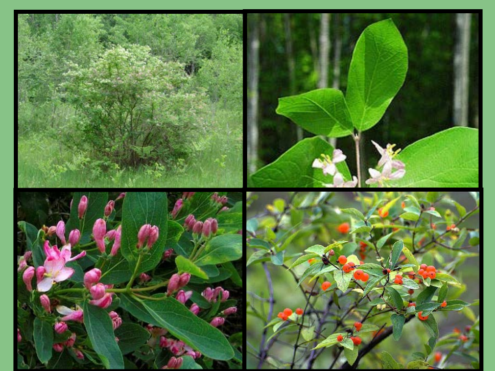
Tatarian honeysuckle ( Lonicera tatarica )