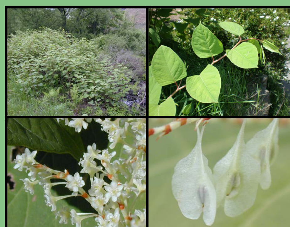
Japanese knotweed ( Polygonum cuspidatum )