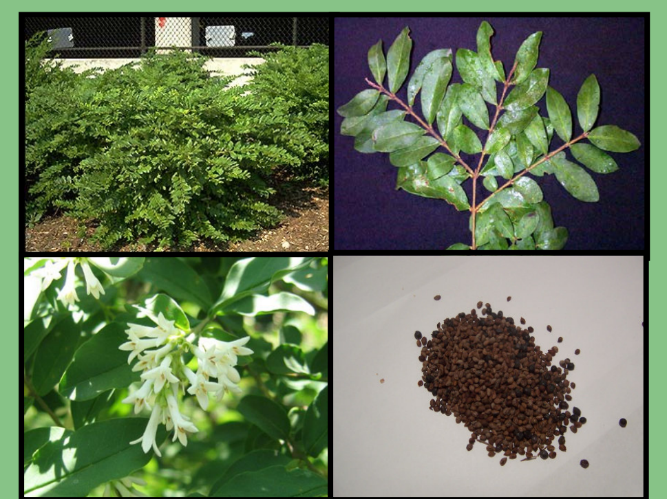
Blunt-leaved privet ( Ligustrum obtusifolium )