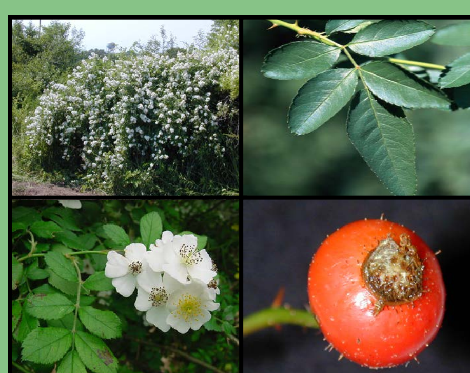
Multiflora rose ( Rosa multiflora )