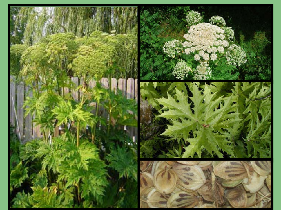
Giant hogweed ( Heracleum mantegazzianum )