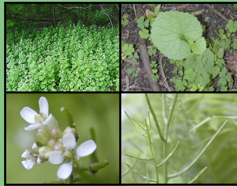
Garlic mustard ( Alliaria petiolata )