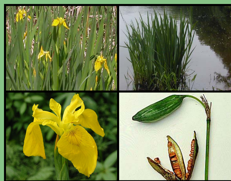
Yellow flag iris ( Iris pseudacorus )