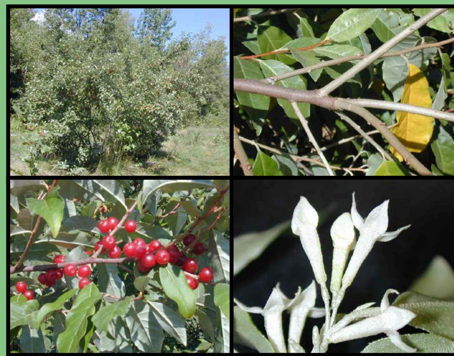
Autumn olive ( Elaeagnus umbellata )