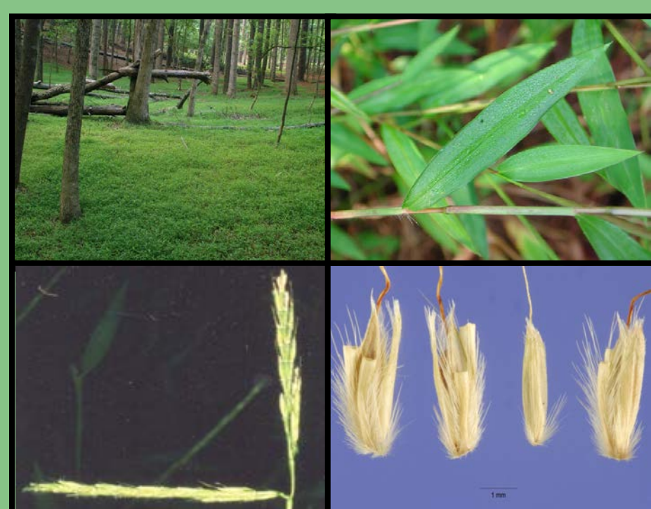
Japanese stilt grass ( Microstegium vimineum )