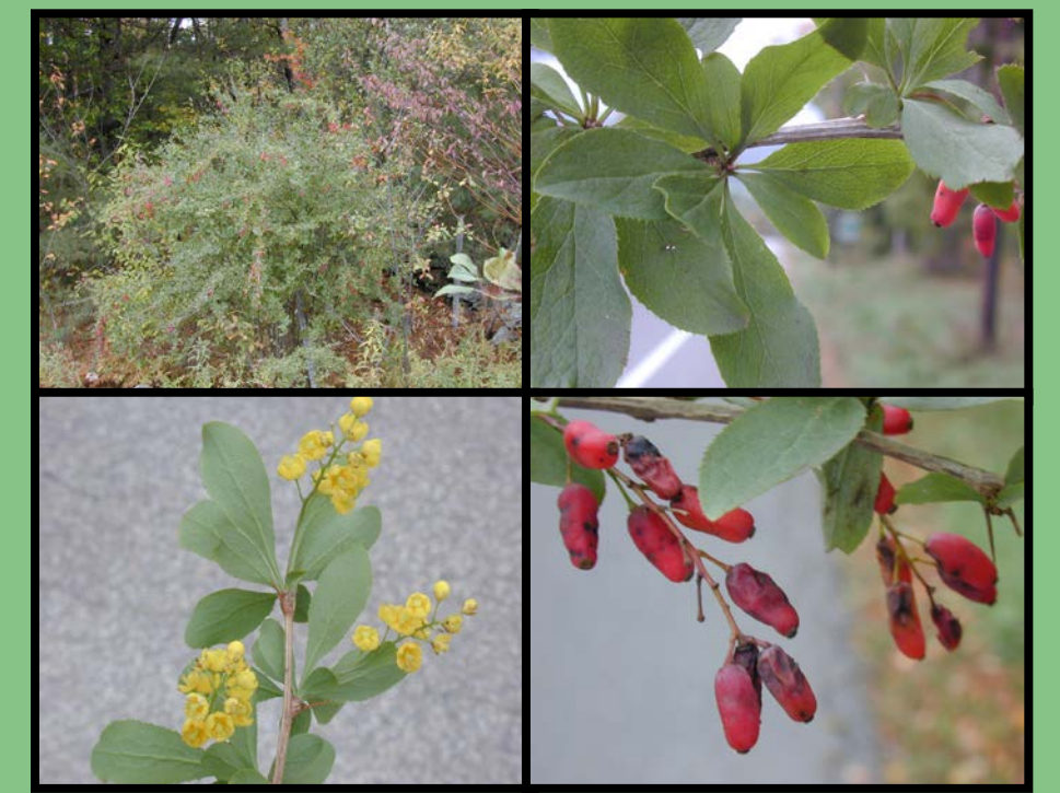
European barberry ( Berberis vulgaris )