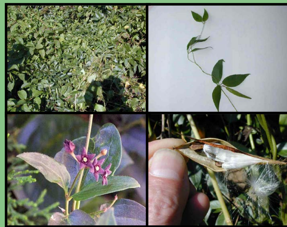
Black swallow-wort ( Cynanchum nigrum )