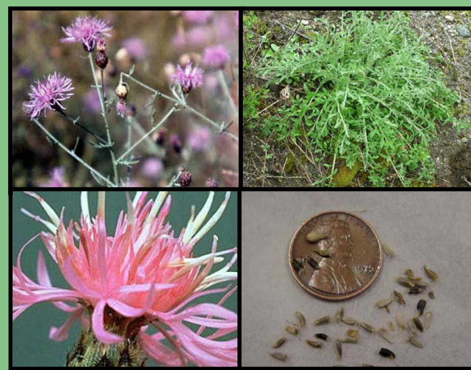
Spotted knapweed ( Centaurea biebersteinii )