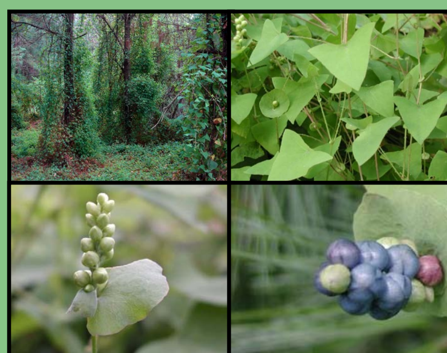
Mile-a-minute vine ( Polygonum perfoliatum )