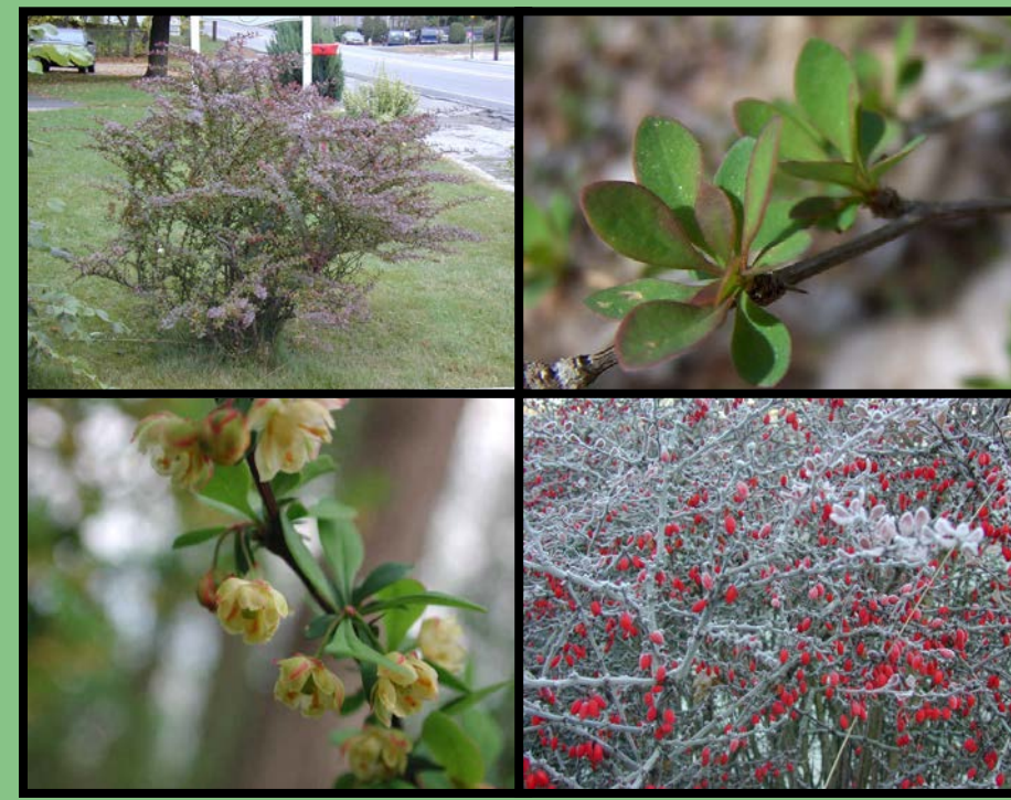
Japanese barberry ( Berberis thunbergii )