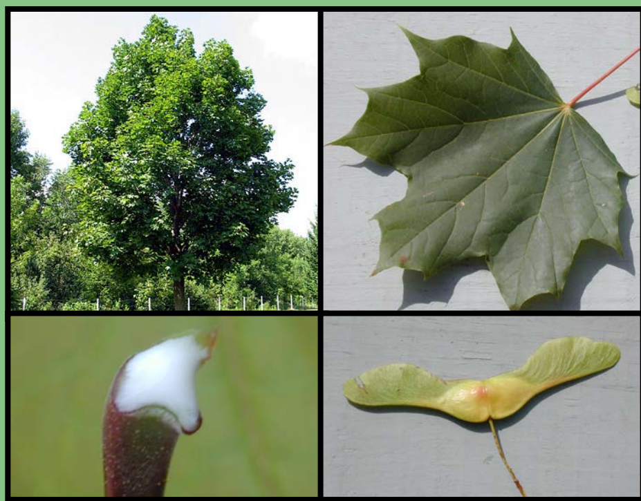
Norway maple ( Acer platanoides )

Department of Agriculture, Markets & Food, Division of Plant Industry