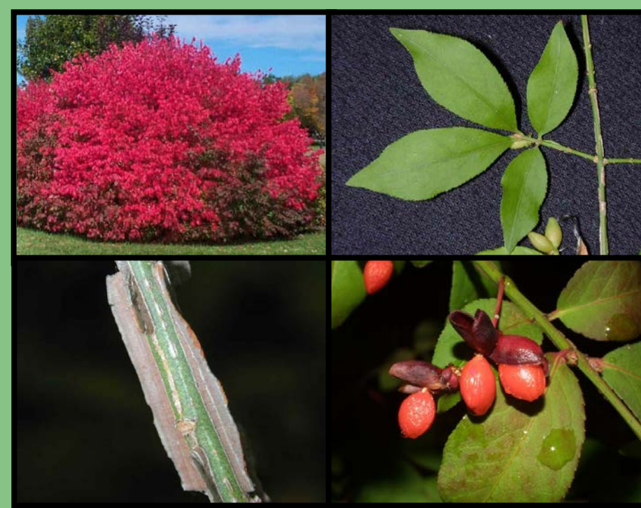
Burning bush ( Euonymus alatus )