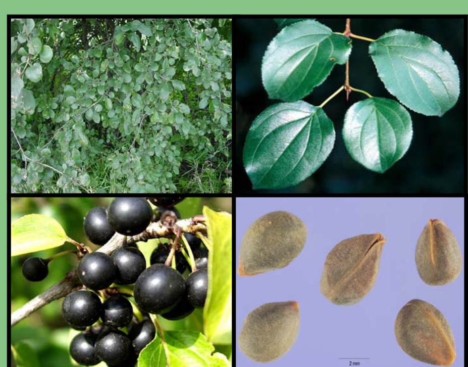
Common buckthorn ( Rhamnus cathartica )