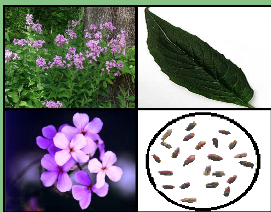
Dame's Rocket ( Hesperis matronalis )