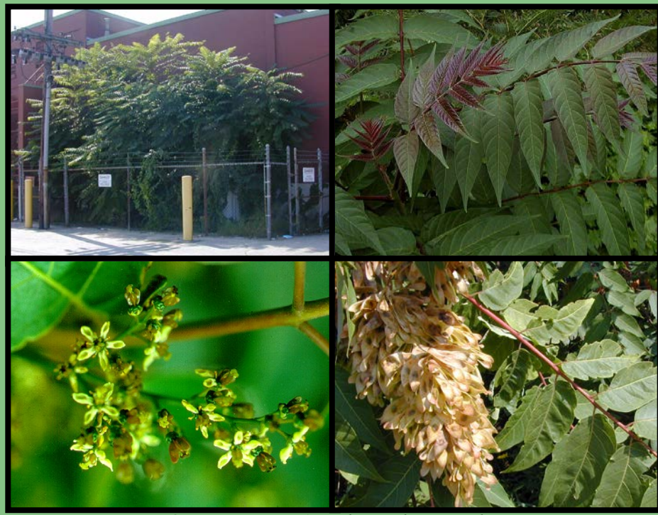
Tree of heaven ( Ailanthus altissima )